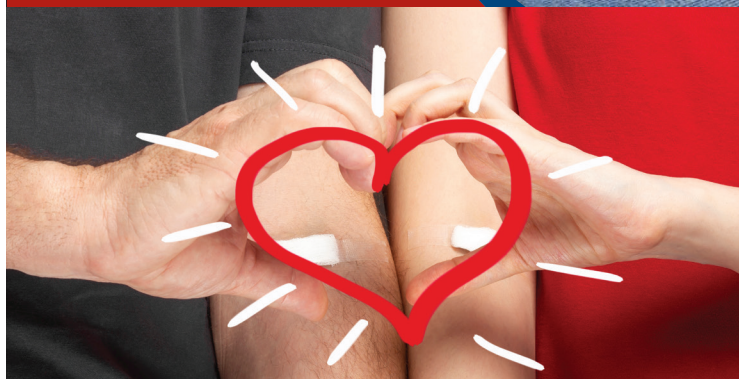
JANUARY IS NATIONAL BLOOD DONATION MONTH