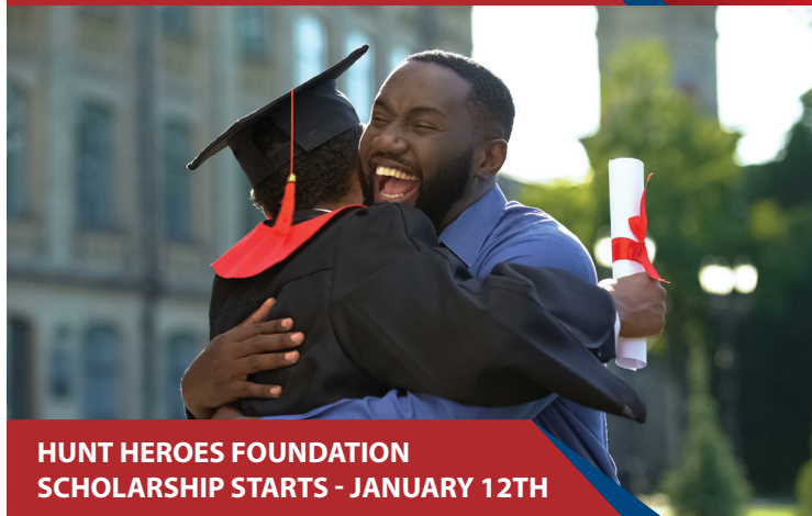
HUNT HEROES FOUNDATION SCHOLARSHIP STARTS - JANUARY 12TH