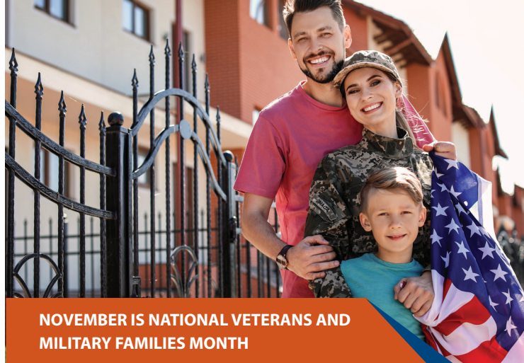
NOVEMBER IS NATIONAL VETERANS AND MILITARY FAMILIES MONTH