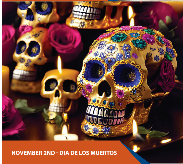
NOVEMBER 2ND - DIA DE LOS MUERTOS